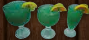
Green Iguana Margarita LG MD SM