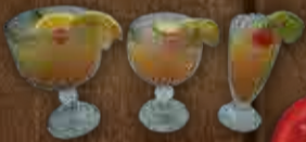
Huracan Margarita LG MD SM