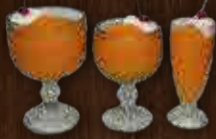
Mango Margarita LG MD SM