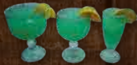
Blue Margarita LG MD SM