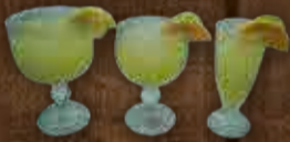
House Lime Margaritas LG MD SM