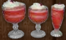
Strawberry Margarita LG MD SM