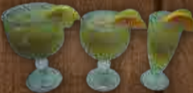
Texana Magarita LG MD SM