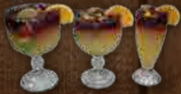
Sangria Margarita LG MD SM